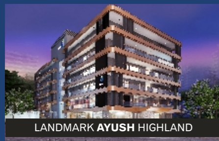
LANDMARK AYUSH HIGHLAND