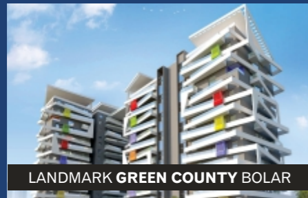
LANDMARK GREEN COUNTY BOLAR