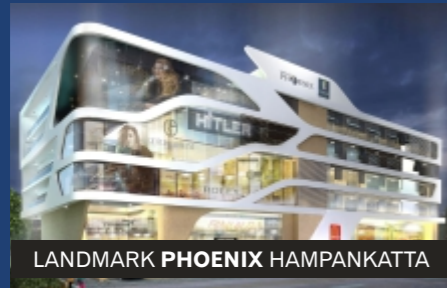
LANDMARK PHOENIX HAMPANKATTA