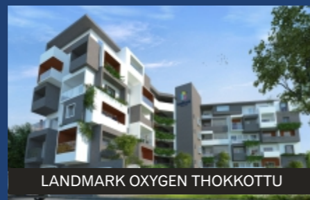
LANDMARK OXYGEN THOKKOTTU