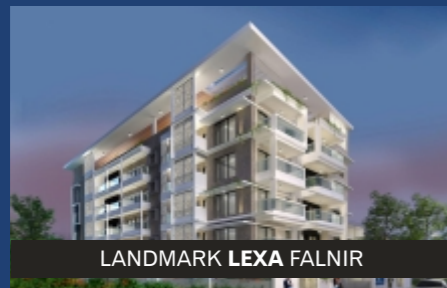
LANDMARK LEXA FALNIR