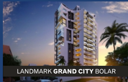
LANDMARK GRAND CITY BOLAR