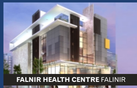
FALNIR HEALTH CENTRE FALINIR

If one is searching for builders in Mangalore. Landmark Infratech are the pioneer builders committed at creating Stylish, Modern and Spacious residential and commercial places. Ethnicity clubbed with modern outlook is what we serve here as builders in Mangalore. We make those eligible residential and commercial complexes which is the most apposite to hold your dreams. Landmark Infratech believes in progressive techniques and new innovation strategies to build a nest for you, which is one of the best of its class and kind. Landmark Infratech work on trust, transparency and confidence. These builders, Landmark Infratech in its project 'Landmark Green County' prove that the ethnic touch of Mangalore is kept untouched by the complexity of modernity.