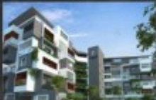
LANDMARK OXYGEN THOKKOTTU