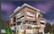
LANDMARK AYUSH HIGHLAND