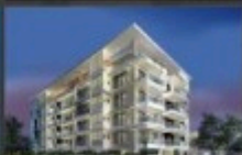
LANDMARK LEXA FALNIR