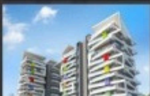
LANDMARK GREEN COUNTY BOLARI