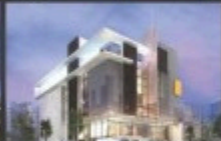
FALNIR HEALTH CENTRE FALNIR