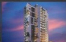
LANDMARK GRAND CITY PANDESHWAR