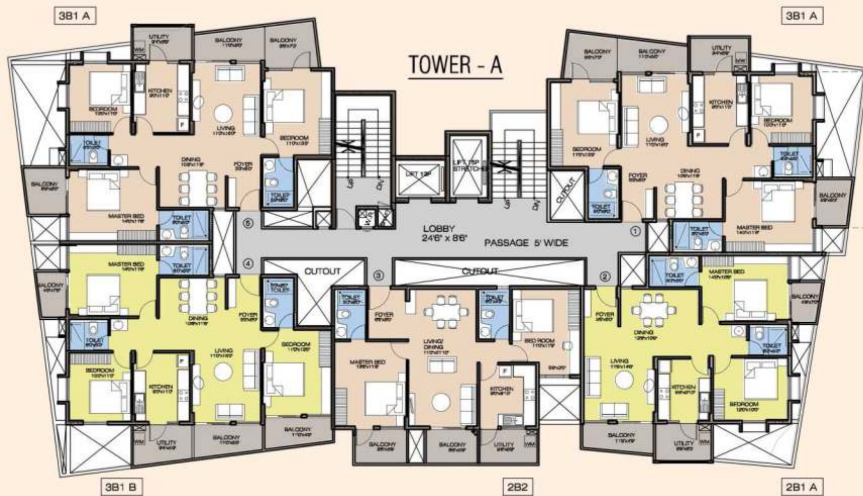
TOWER - A