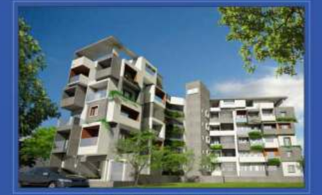
Landmark OXYGEN, Thokkottu