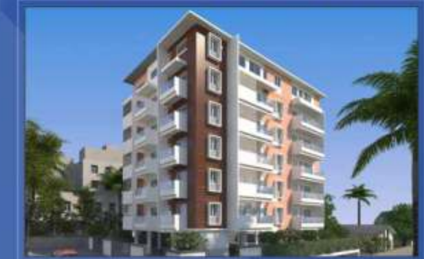
Landmark VALENCITY, Valencia