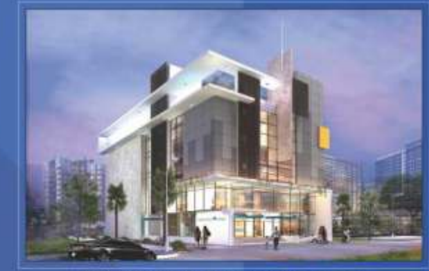
FALNIR HEALTH CENTRE, Falnir