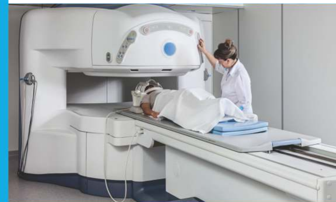
HI TECH - X-RAY INSPECTION SYSTEMS