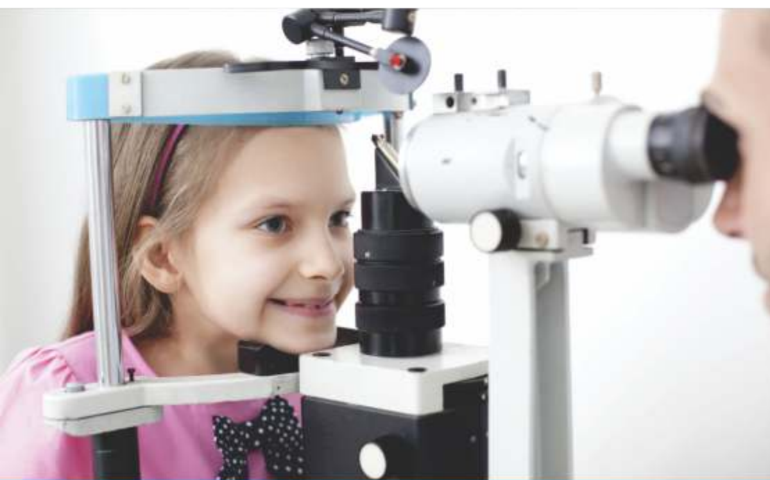
HIGH TECH OPTICAL SHOWROOM

RADIOLOGY/X-RAY FACILITY: X-Ray pleophos-D, 300 MA Siemens available, X-rays done on all working days during OPD hour. Sonoline G-50 U/S machine, Siemens. Ultrasounds are done once a week.